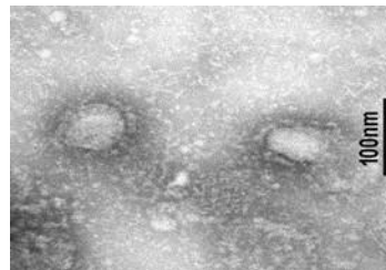
* 2003 Sars Coronavirus, Em

In 2003, following the outbreak of severe acute respiratory syndrome (SARS) in Asia, with secondary cases elsewhere in the world, the World Health Organization (WHO) issued a press release stating that a novel coronavirus identified by a number of laboratories was the causative agent for SARS. The virus was officially named the SARS coronavirus (SARS-CoV). Over 8,000 people were infected, and about 10% died.